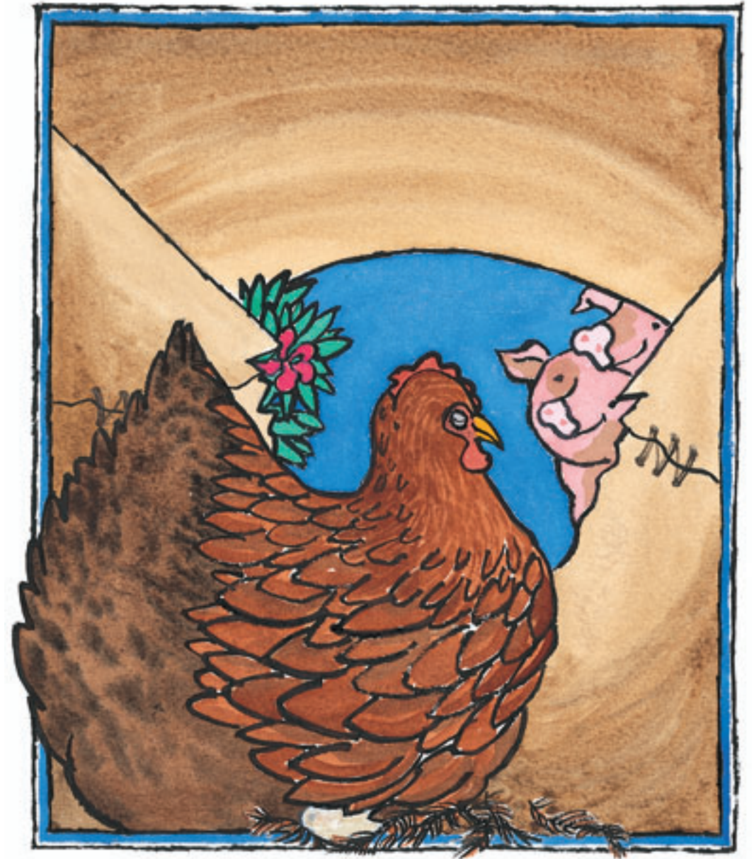
She was safe from the cheeky pigs.