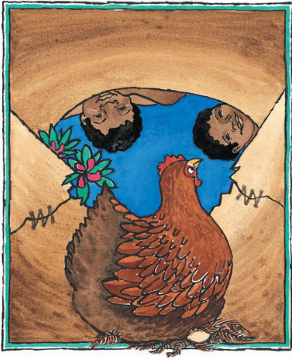
She was safe from the children.